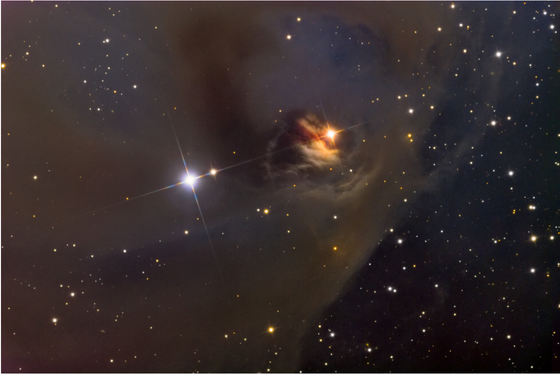
FIG. 2.— NGC 1555, the Hind’s Variable Nebula. This image is licensed under a Creative Commons Attribution – Share.Alike 3.0 United States License. T Tauri appears orange, in the vicinity of the nebula. The view through the Hind’s eyepiece in 1852 would have been very different – much fainter and without colors.

John Russell Hind died on December 23, 1895 at Twickenham.